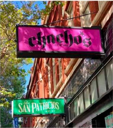
Sabor del Valle Chicho's food and custom drinks from San Patricios will be featured at our VIP reception. Delicious! Get your tickets at www.sabordelvalle.org